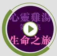
6 th episode: 生命之旅