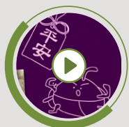
1 st episode: 病人的禮物

Chicken Soup for the Doctor's Soul features a collection of interesting life experiences, professional anecdotes, and inspirational personal stories from Academy Fellows in Hong Kong. Past episodes are available on the Academy website.