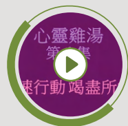
8 th episode (Part 1): 迅速行動 竭盡所能