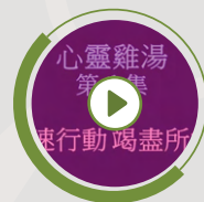
8 th episode (Part 2): 迅速行動 竭盡所能