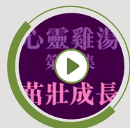
3 rd episode: 茁壯成長