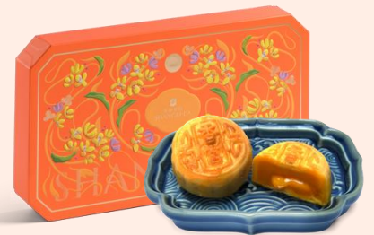
Shang Palace Mini Lava Egg Custard Mooncakes (8 pieces) 香宮迷你流心奶皇月餅 (八件裝)

Original Price 原價: HKD538 Discounted Price 優惠價: HKD376.6