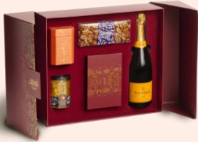
Celebratory Collection - Island Gourmet # 高美窩心獻禮禮盒 #

Original Price 原價: HKD408 Discounted Price 優惠價: HKD326.4