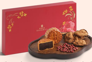
Shang Palace 30-year Aged Mandarin Peel and Red Bean Paste Mooncakes (8 pieces) 香宮三十年陳皮豆沙月餅 (八件裝)

Original Price 原價: HKD438 Discounted Price 優惠價: HKD306.6