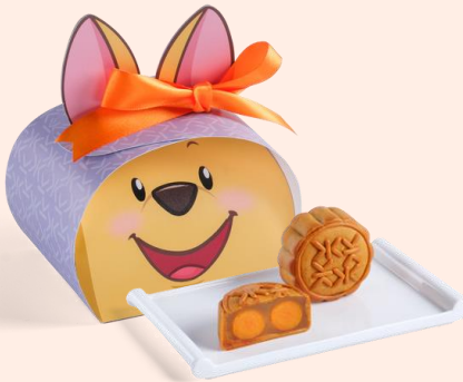
Hung Tong Double Egg Yolks with White Lotus Seed Paste Mooncakes (Single Piece) 紅糖雙黃白蓮蓉月餅 (單件裝)

Original Price 原價: HKD408 Discounted Price 優惠價: HKD306