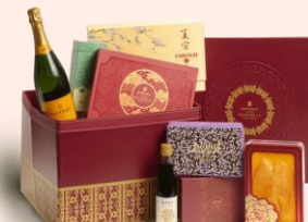
Gold Hamper # 璧月禮物籃 #

Includes: · Summer Palace Mini Milk Custard Mooncakes (8 pieces), Shangri-La Chocolates, Shangri-La Cookies, Traditional Jam, Dried Porcini Noodles Gift Box, Black Garlic and Himematsutake Mushroom Gift Box, Chinese Tea, French Red Wine 包括: · 夏宮迷你奶黃月餅 (八件裝)、香格里拉朱古力、香格里拉曲奇、傳統果醬、牛肝菌麵麵禮盒、黑蒜及姬松茸禮盒、中國茶、法國紅酒