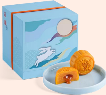
Hung Tong Mini Lava Egg Custard Mooncakes (8 pieces) 紅糖迷你流心奶黃月餅 (八件裝)

Original Price 原價: HKD468 Discounted Price 優惠價: HKD351