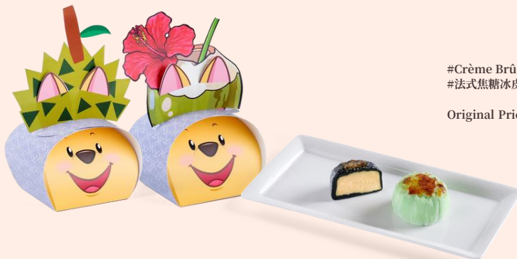
#Crème Brûlée Snowy Mooncakes Duet (2 pieces) #法式焦糖冰皮月餅二重奏 (兩件裝)

Original Price 原價: HKD520 Discounted Price 優惠價: HKD390