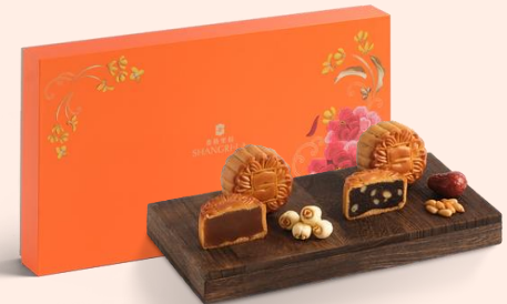
Shang Palace Vegetarian Mooncakes Duet (8 pieces, including 4 pieces for each of the following) · Mini Red Date Paste Mooncakes with Pine Nuts · Mini Golden Lotus Seed Paste Mooncakes

Original Price 原價: HKD478 Discounted Price 優惠價: HKD334.6