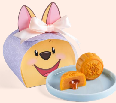
Hung Tong Mini Lava Egg Custard Mooncakes (Single Piece) 紅糖迷你流心奶黃月餅 (單件裝)

Original Price 原價: HKD100 Discounted Price 優惠價: HKD75