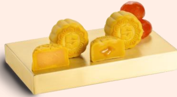
Ming Pavilion Mooncake Selection (6 pieces) · Milk Custard Mooncakes · Molten Lava Milk Custard Mooncakes 茗悅甄選月餅禮盒 (六件裝, 包括以下每款各三件) · 奶黃月餅 · 流心奶黃月餅

Original Price 原價: HKD528 Discounted Price 優惠價: HKD422.4