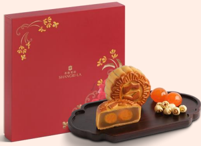
Shang Palace Double Egg Yolks with White Lotus Seed Paste Mooncakes (4 pieces) 香宮雙黃白蓮蓉月餅 (四件裝)

Original Price 原價: HKD478 / Discounted Price 優惠價: HKD334.6