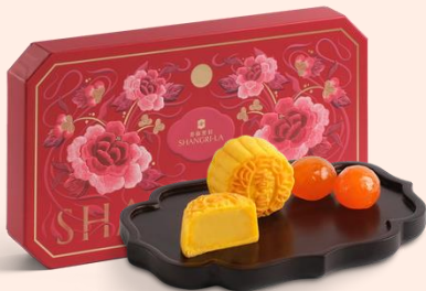
Shang Palace Mini Egg Custard Mooncakes (8 pieces) 香宮迷你奶皇月餅 (八件裝)

Original Price 原價: HKD438 Discounted Price 優惠價: HKD306.6