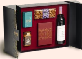
Celebratory Collection - Restaurant Petrus # 珀翠經典獻禮禮盒 #

Includes: · Candied Walnuts, Shangri-La Chocolates, Summer Palace X.O. Sauce, Honey, Veuve Clicquot Champagne 包括: · 琥珀合桃、香格里拉朱古力、夏宮X.O.醬、蜜糖、Veuve Clicquot 香檳