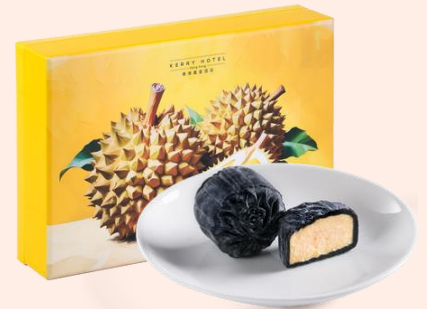
Hung Tong Black Thorn Durian Snowy Mooncakes (6 pieces) 黑刺榴槿糖冰皮月餅 (六件裝)

Original Price 原價: HKD60 Discounted Price 優惠價: HKD45