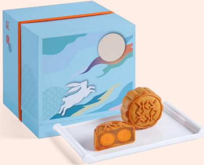
Hung Tong Double Egg Yolks with White Lotus Seed Paste Mooncakes (4 pieces) 紅糖雙黃白蓮蓉月餅 (四件裝)

Original Price 原價: HKD468 Discounted Price 優惠價: HKD351