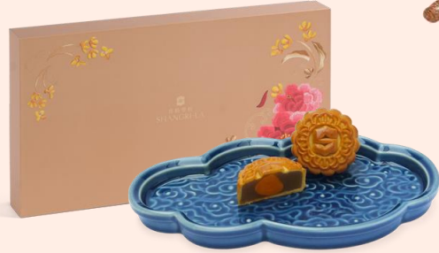
Shang Palace Mini Mooncakes with Egg Yolk and White Lotus Seed Paste (8 pieces) 香宮迷你蛋黃白蓮蓉月餅 (八件裝)

Original Price 原價: HKD478 / Discounted Price 優惠價: HKD334.6