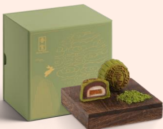
Shang Palace Mini Matcha Mooncakes with Red Bean, Yuzu Paste and Mochi (8 pieces) * 香宮迷你抹茶紅豆柚子白玉月餅 (八件裝) *

Original Price 原價: HKD438 Discounted Price 優惠價: HKD306.6