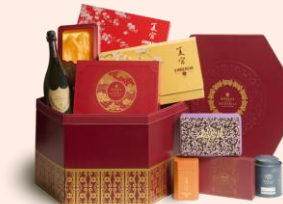
Diamond Hamper # 朗月禮物籃 #

Includes: · Summer Palace Mini Milk Custard Mooncakes (8 pieces), Summer Palace Mini Mooncakes with White Lotus Seed Paste and Egg Yolk (8 Pieces), Shangri-La Chocolates, Shangri-La Cookies, Summer Palace X.O. Sauce, Dried Conch and Himematsutake Mushroom Gift Box, Fish Maw, Dried Hokkaido Scallop, Chinese Tea, Premium French Red Wine 包括: · 夏宮迷你奶黃月餅 (八件裝)、夏宮迷你蛋黃白蓮蓉月餅 (八件裝)、香格里拉朱古力、香格里拉曲奇、夏宮X.O.醬、螺頭及姬松茸禮盒、花膠、北海道元貝、中國茶、特級法國紅酒