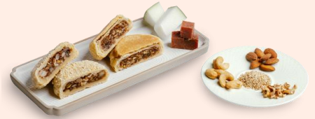
Ming Pavilion Fujian Mooncakes (4 pieces) · Original Fujian Mooncakes · Sesame Fujian Mooncakes 茗悅福建月餅禮盒 (四件裝, 包括以下每款各兩件) · 原味福建月餅 · 芝麻福建月餅

Original Price 原價: HKD408 Discounted Price 優惠價: HKD326.4