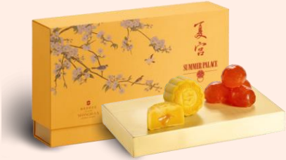
Summer Palace Deluxe Molten Lava Milk Custard Mooncakes (8 pieces) 夏宮特級流心奶黃月餅 (八件裝)

Original Price 原價: HKD528 Discounted Price 優惠價: HKD422.4