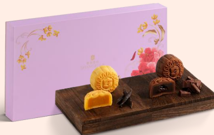
Shang Palace Signature Mooncakes Duet (8 pieces, including 4 pieces for each of the following) · Mini Vanilla Egg Custard Mooncakes · Mini Lava Chocolate Mooncakes

Original Price 原價: HKD658 Discounted Price 優惠價: HKD460.6