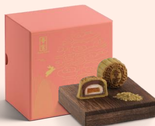
Shang Palace Mini Hojicha Mooncakes with Red Bean, Yuzu Paste and Mochi (8 pieces) * 香宮迷你焙茶紅豆柚子白玉月餅 (八件裝) *

Original Price 原價: HKD438 Discounted Price 優惠價: HKD306.6