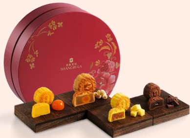
Shang Palace Signature Mooncakes Quartet (12 pieces, including 3 pieces for each of the following) · Mini Egg Custard Mooncakes · Mini Mooncakes with Egg Yolk and White Lotus Seed Paste · Mini Lava Chocolate Mooncakes · Mini Pineapple Mooncakes

Original Price 原價: HKD498 Discounted Price 優惠價: HKD348.6