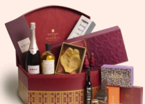
Harvest Moon Hamper # 花好月圓禮物籃 #

Includes: · Summer Palace Mini Milk Custard Mooncakes (8 pieces), Summer Palace Mini Mooncakes with White Lotus Seed Paste and Egg Yolk (8 pieces), Shangri-La Chocolates, Shangri-La Cookies, Summer Palace X.O. Sauce, Matsutake and Sliced Conch Gift Box, Fish Maw, English Tea, Dom Pérignon Champagne 包括: · 夏宮迷你奶黃月餅 (八件裝)、夏宮迷你蛋黃白蓮蓉月餅 (八件裝)、香格里拉朱古力、香格里拉曲奇、夏宮X.O.醬、松茸及螺片禮盒、花膠、英式紅茶、Dom Pérignon 香檳