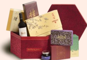
Silver Hamper # 明月禮物籃 #

Includes: · Candied Walnuts, Shangri-La Chocolates, Restaurant Petrus Vegan X.O. Sauce, Manuka Honey, Premium French Red Wine 包括: · 琥珀合桃、香格里拉朱古力、珀翠純素X.O.醬、麥蘆卡蜂蜜、特級羊肚菌禮盒、特級法國紅酒