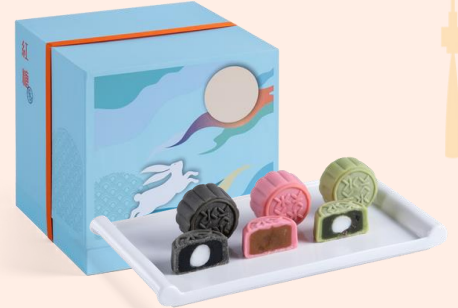
Hung Tong Mini Mooncakes Trio (6 pieces) 紅糖迷你月餅三重奏 (六件裝)

Original Price 原價: HKD398 Discounted Price 優惠價: HKD298.5