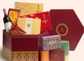
Platinum Hamper # 皓月禮物籃 #

Includes: · Summer Palace Mini Milk Custard Mooncakes (8 pieces), Shangri-La Chocolates, Shangri-La Cookies, Japanese Kuromame Shoyu, Premium Shiitake and Matsutake Gift Box, Fish Maw, Chinese Tea, Veuve Clicquot Champagne 包括: · 夏宮迷你奶黃月餅 (八件裝)、香格里拉朱古力、香格里拉曲奇、日本純釀黑豆醬油、松茸及花菇禮盒、花膠、中國茶、Veuve Clicquot 香檳