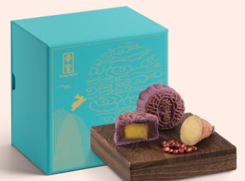
Shang Palace Mini Naruto Kintoki Mooncakes with Red Bean (8 pieces) * 香宮迷你金時番薯紅豆月餅 (八件裝) *

Original Price 原價: HKD438 Discounted Price 優惠價: HKD306.6